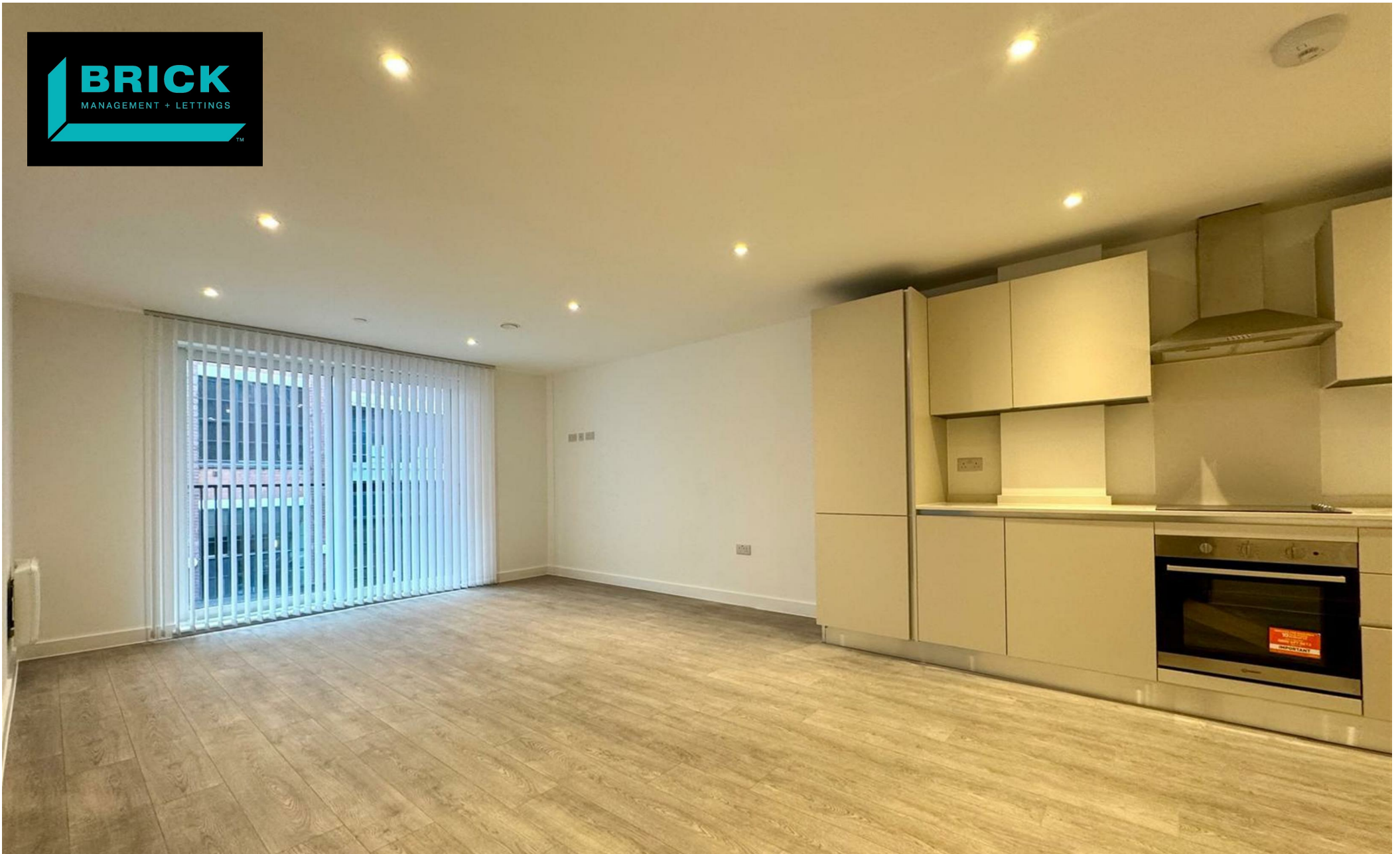
Apartment 47 25 Green Street, Birmingham, B12 0EW £995 Per month