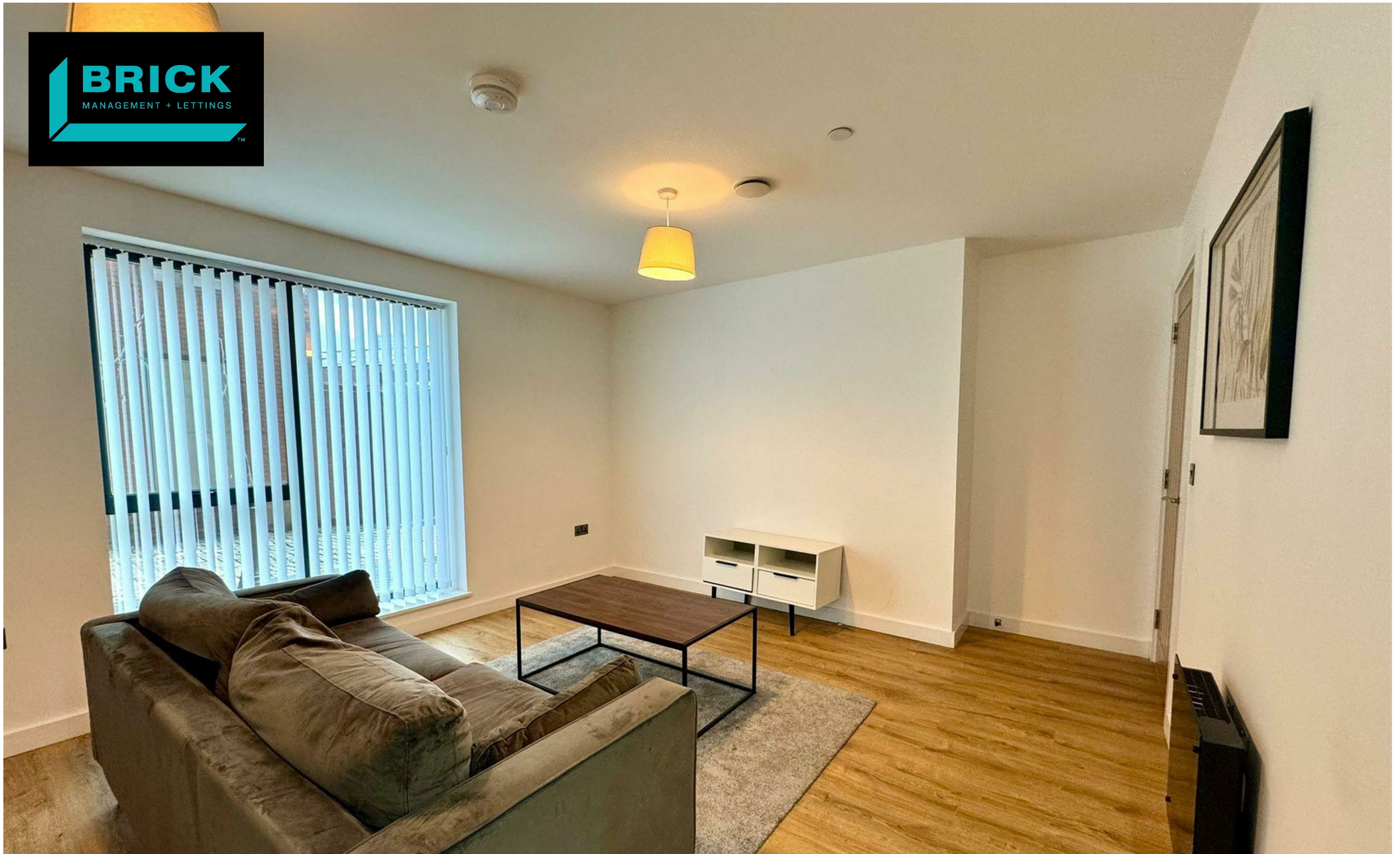
Apartment 1 8 Camden Drive, Birmingham, B1 3LT £950 Per month